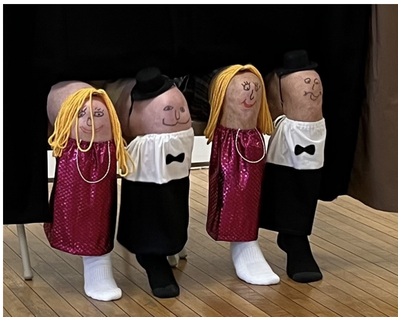
Dancing Knees from the Talent Show